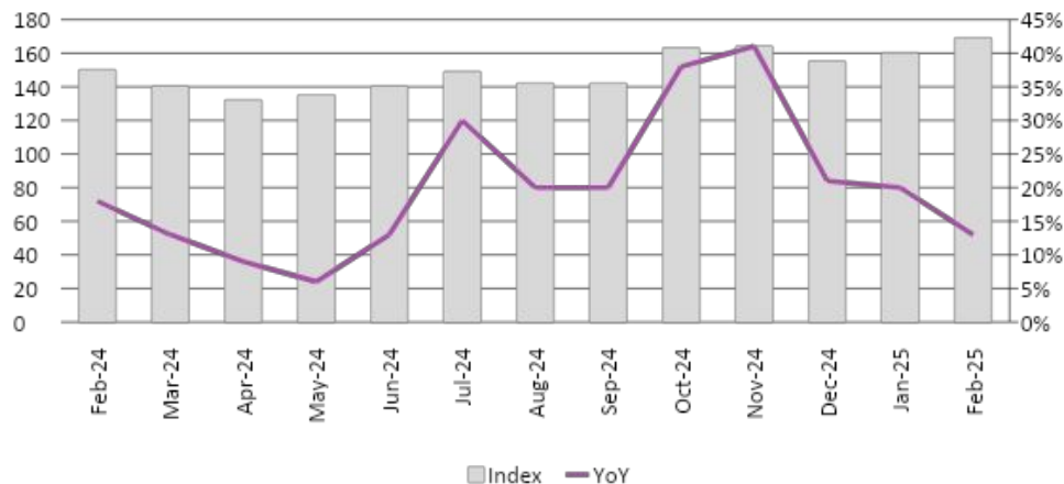
foundit Insights Tracker