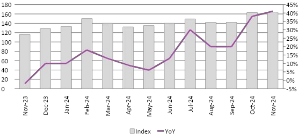
foundit Insights Tracker